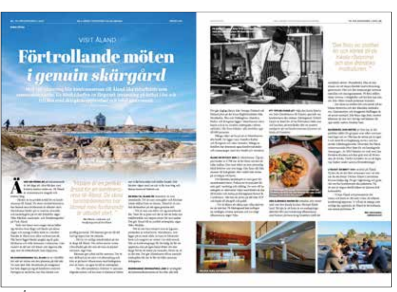
Visit Åland, Tid för konferens #01-2023