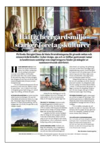
Hooks Herrgård, Tid för konferens #02-2023