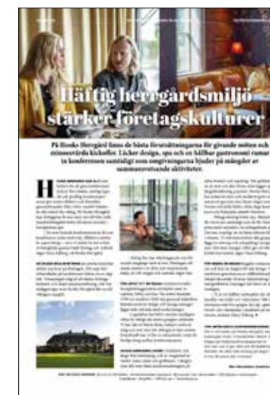
Hooks Herrgård, Tid för konferens #02-2023