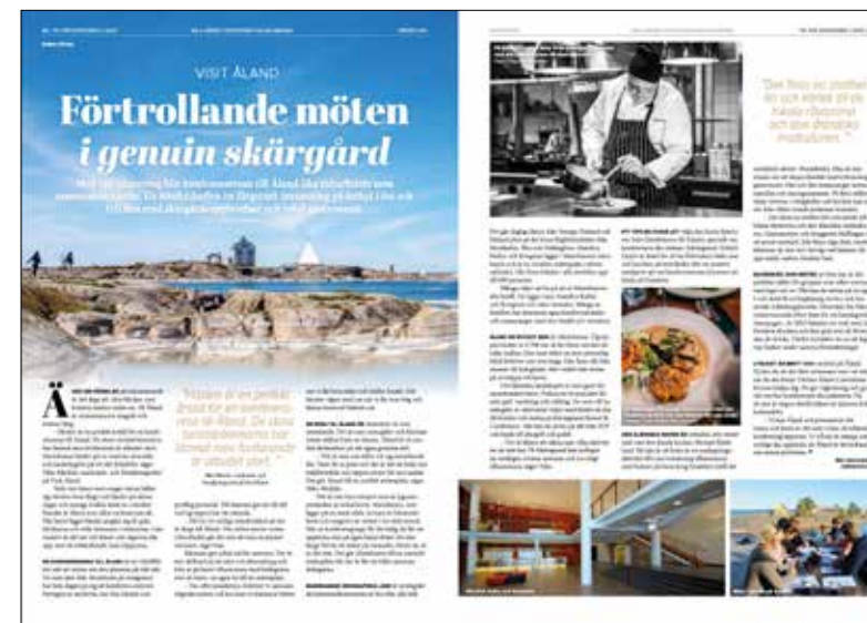
Visit Åland, Tid för konferens #01-2023