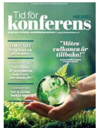
A selection of our previous editions.