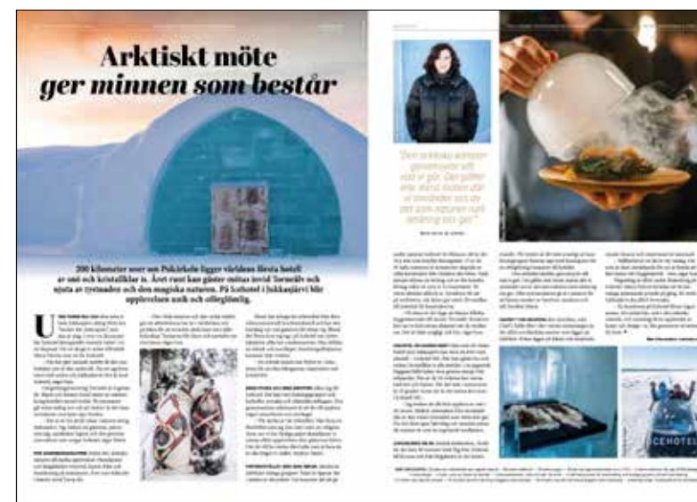
Icehotel, Tid för konferens #02-2023